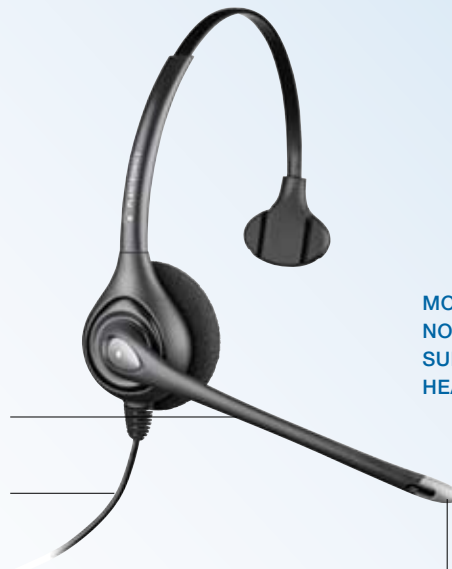
MONAURAL NOISE-CANCELLING SUPRAPLUS WIDEBAND HEADSET

Plantronics Ltd Wootton Bassett, UK 0800 410014 +44 (0)1793 842200