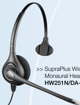
>> SupraPlus Wideband Monaural Headset. HW251N/DA-M