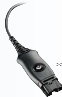
>> Quick Disconnect.