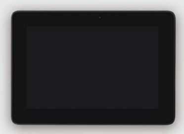
Main Device S30853-H4001-R101